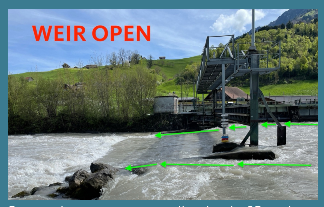
Passway between concrete wall and rocks OR on river right through the weir