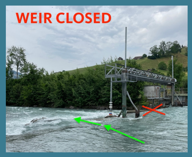
Weir closed, passway left of the slightly visible concrete wall

For both sprint and classic races, put in at the start and take out right at the finish line is not possible. Special put in places will be marked. The take outs will be a little bit further downstream from the finish line. Please use only the marked take outs. For further details, see the course maps.