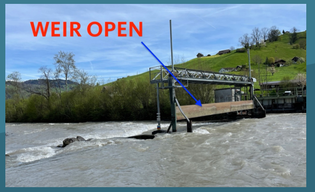
Weir open (the bar might be higher)